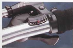
Deore XT Rapidfire Plus gear shifters