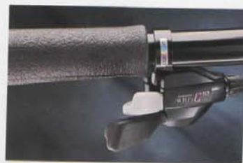
Altus C10 Rapidfire Dual Repeat gear shifters