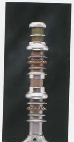
Stronglight A9 sealed roller bearing alloy headset - ultra smooth and hard wearing.