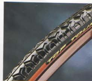
Continental Top Touring tyre - with an extra puncture resistance.