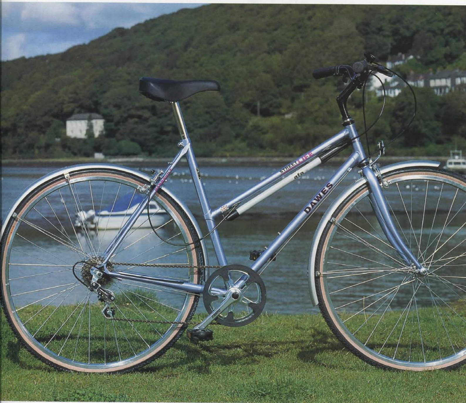
Street Life 18 ladies