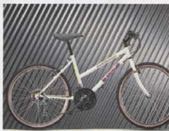
Zig Zag - ladies/girls frame style