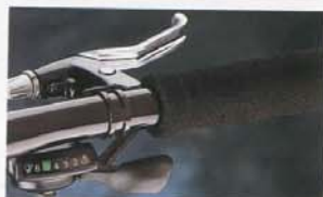
Alivio Rapidfire-L gear shifters with Optical Gear Display