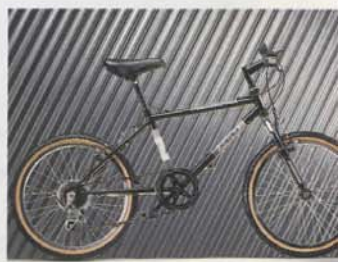
Predator - kids frame style