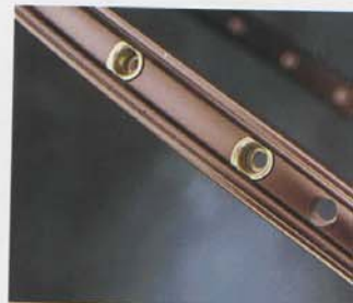
Box-section, double eyeletted rim - for added strength.