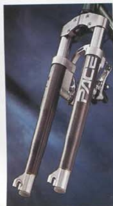
Pace RC-35 suspension