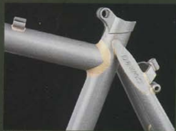
Fillet-brazing is a highly skilled method of joining tubes, which eliminates the need for lugs. The result is a lighter frame.