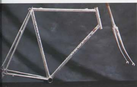
available, Linear framesets supplied with headset fitted.