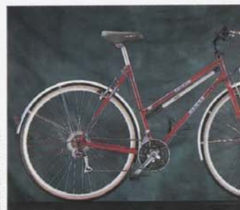
Back Street ladies

Colour co-ordinated ATB bars. Velite foam saddle. Alloy pillar & stem. Beartop pedals. Chromo mudguards.