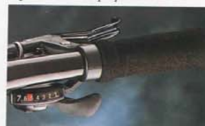
STX Rapidfire Plus gear shifters with Optical Gear Display