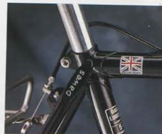
Seat cluster with internal cable routing, and oversized seat post - for increased rigidity.