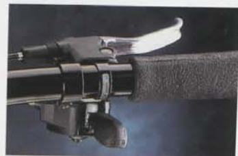
Altus C50 Rapidfire Unilever

DAMAGE LIMITATION PAINT SYSTEM 5 YEAR GUARANTEE